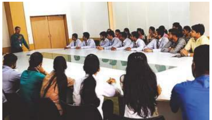
Classroom and Conference Hall