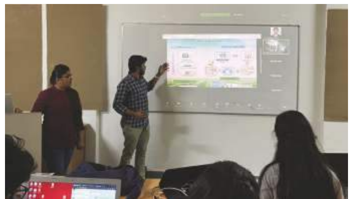
Expert Talk Series organised by Placement Cell in Online mode as well as on campus