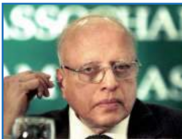
Prof. MS Swaminathan Pioneer of India's Green Revolution