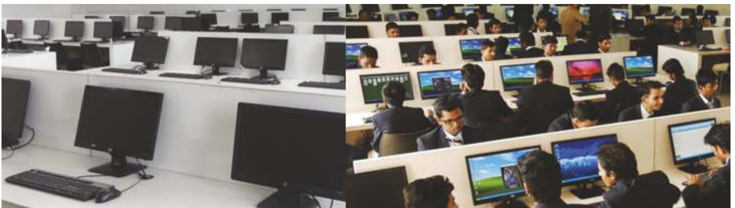
Computer & IT Infrastructure