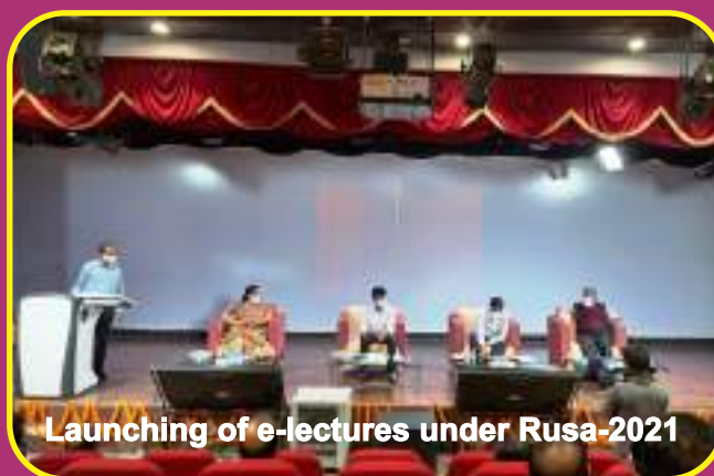
Launching of e-lectures under Rusa-2021