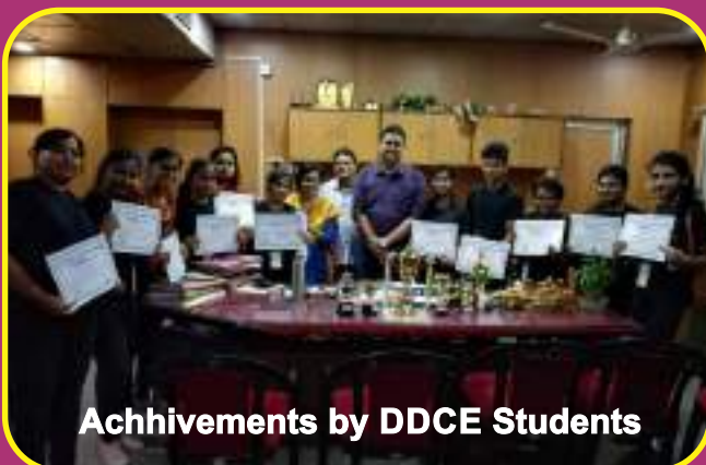
Achhivements by DDCE Students