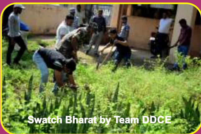
Swatch Bharat by Team DDCE