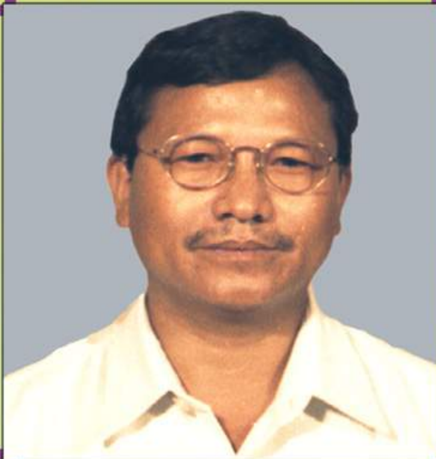
LATE DERA NATUNG (FORMER EDUCATION MINISTER)